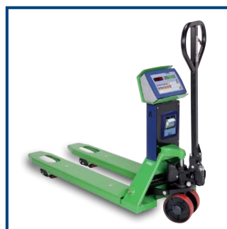
Pallet truck scales