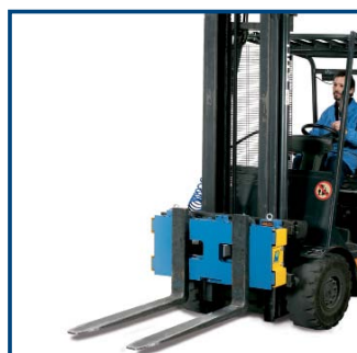
Weighing kit for lift truck forks