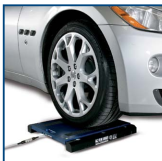
Wheel weighing platforms

The range of DINI ARGEO products includes also: